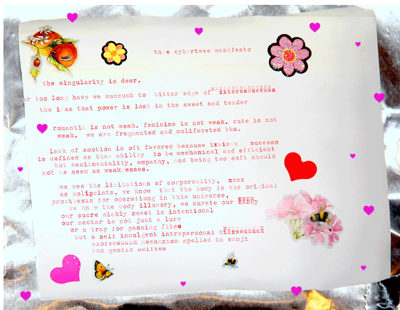
Figure 2: the cybertwee manifesto