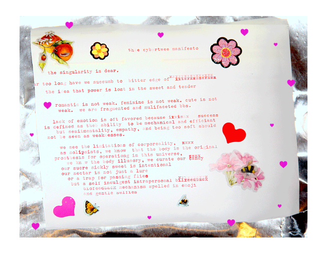
Figure 2: cybertwee manifesto