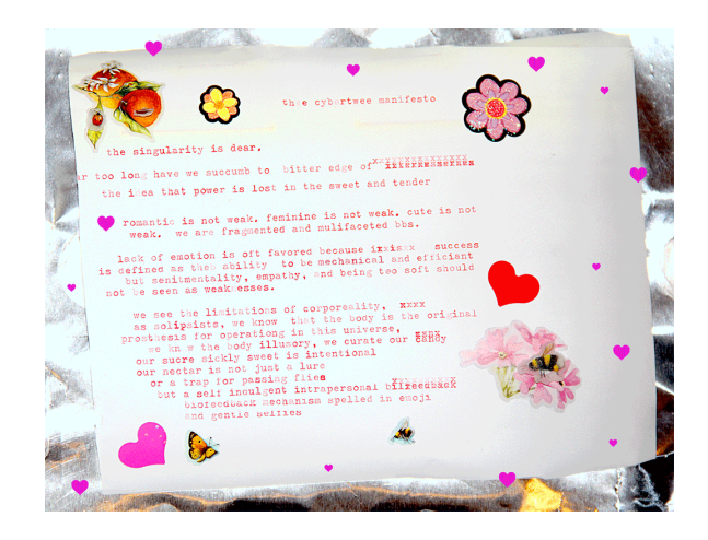
Figure 2: the cybertwee manifesto