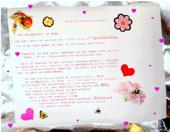
Figure 2: the cybertwee manifesto