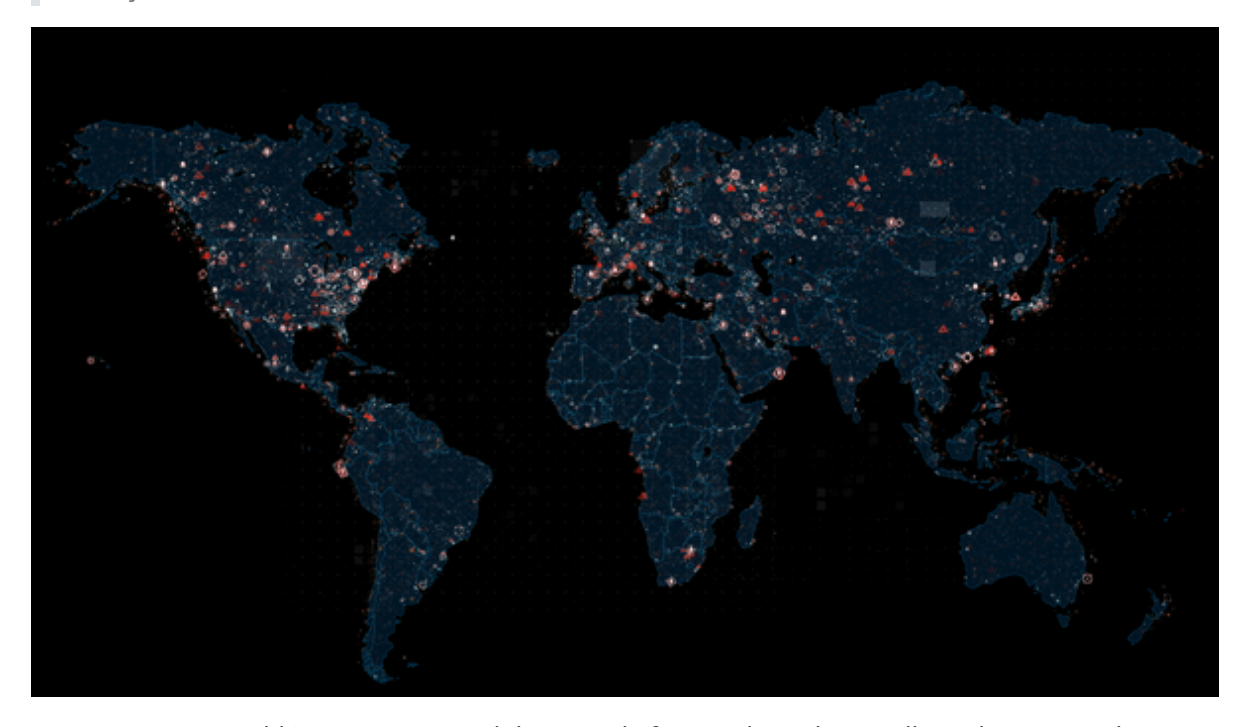
Our world is more connected than ever before, and our data is all out there somewhere.

So anon, while sailing the high seas of the internet, what made you drop your anchors here?