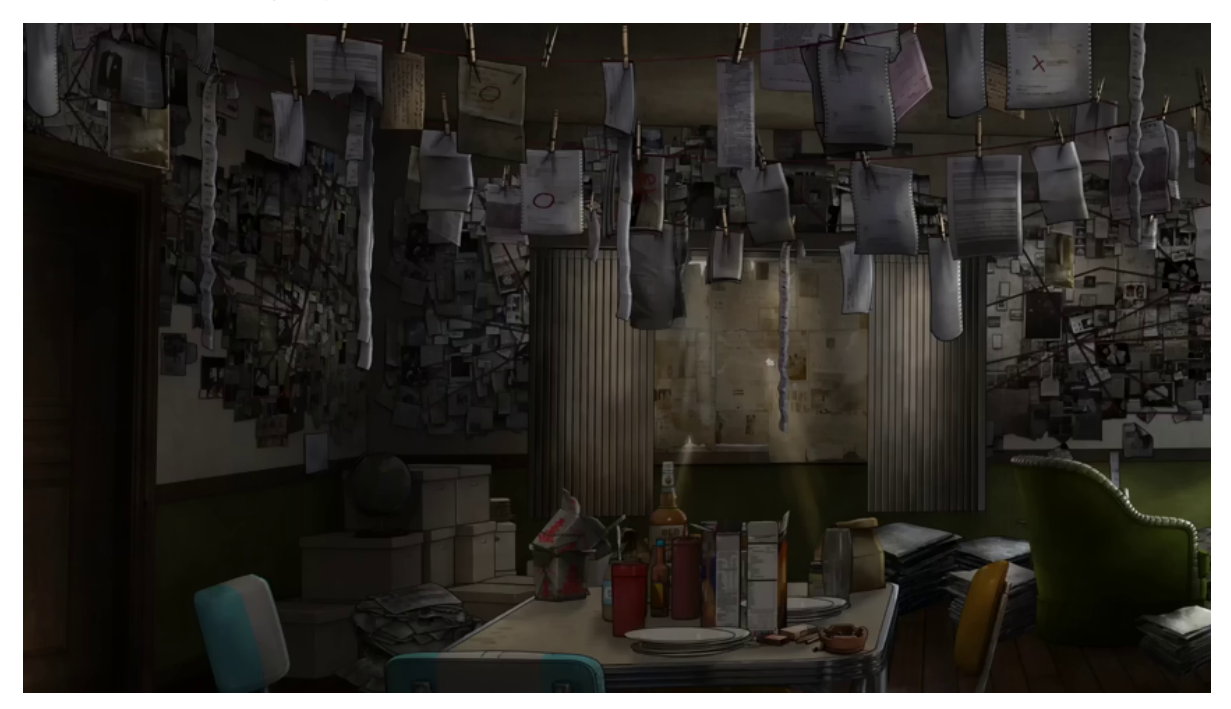
A typical OSINT professionals apartment, in case you were wondering.