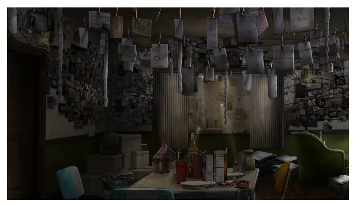
A typical OSINT professionals apartment, in case you were wondering.