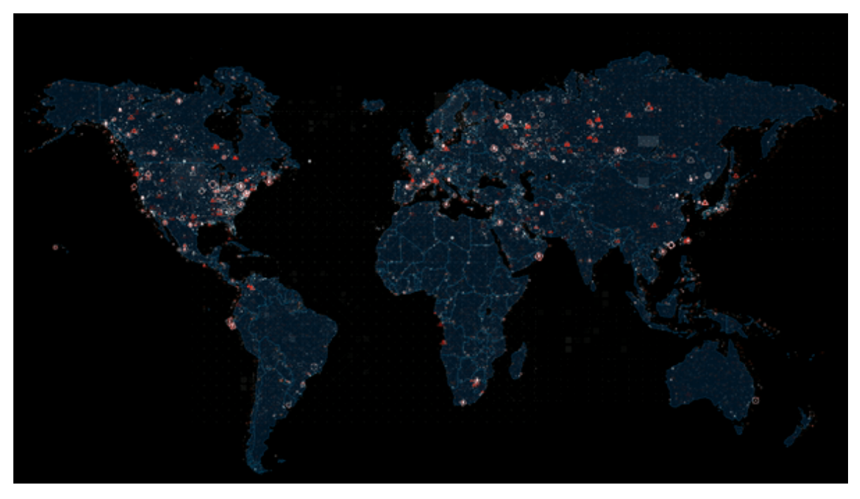
Our world is more connected than ever before, and our data is all out there somewhere.

"The internet is just one giant book that is written in real-time, about all of us. -You just have to know how to read it".