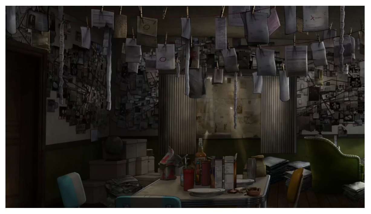
A typical OSINT professionals apartment, in case you were wondering.