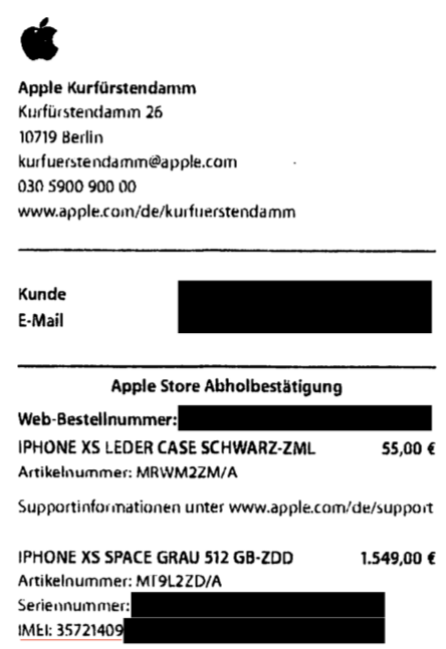
Figure 2. Invoice detailing an IMEI

By changing the SIM, and therefore the IMSI, a user can obtain a new subscriber identity. By changing the IMEI, a user's device obtains a new identity.