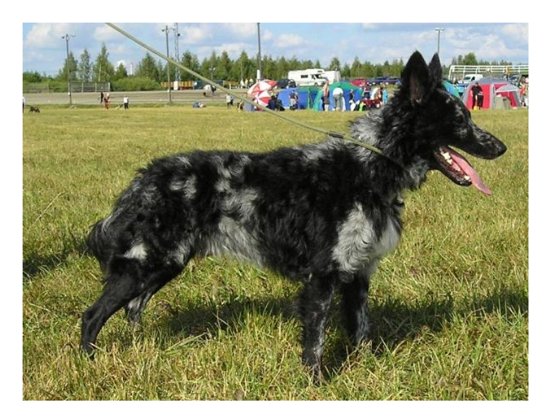
Figure 7. Blue merle Mudi by Taru T Torpström, CC BY-SA 3.0

"Blue merle" is one of the five coat colors recognized for the Mudi dog breed by the Federation Cynologique Internationale and is characterized by its mottled or patched appearance. The black splashes on the blueish-gray coat of the blue merle Mudi inspired the name of this project because of its obscuring appearance and camouflaging symbolism. Figure 7 shows a particularly beautiful specimen of the blue merle Mudi.