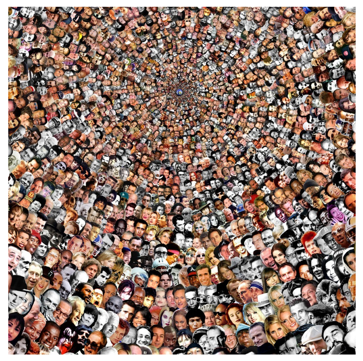
Physiognomy [14]. Clone [15] in computing. What does those words got in common?

In the "Illuminati" pseudo dictatorship all about technology it is applied to human being and society. So we speak about human hacking and not simply hacking. It's fascinating but somewhat disturbing the bizarre but effective result of the creators of this network.