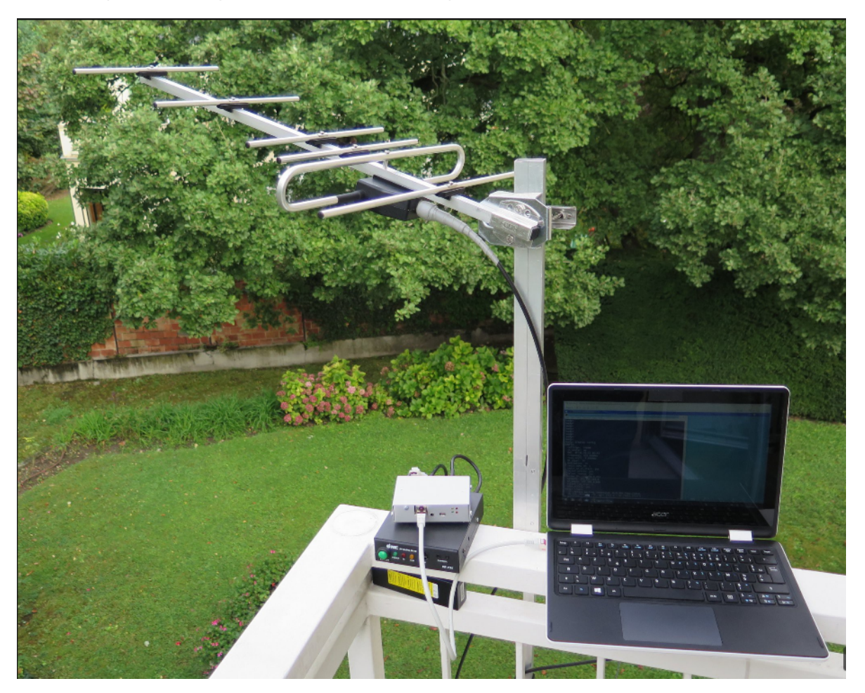
Packet radio [6] was and is a classical solution present in the Linux kernel [7].

Ok, so the first step it's to translate analogue different meters longitude waves into <u>IP</u>. This is almost done with software defined radio, but in the past and probably nowadays something is however up and running there was radio ham bridges.