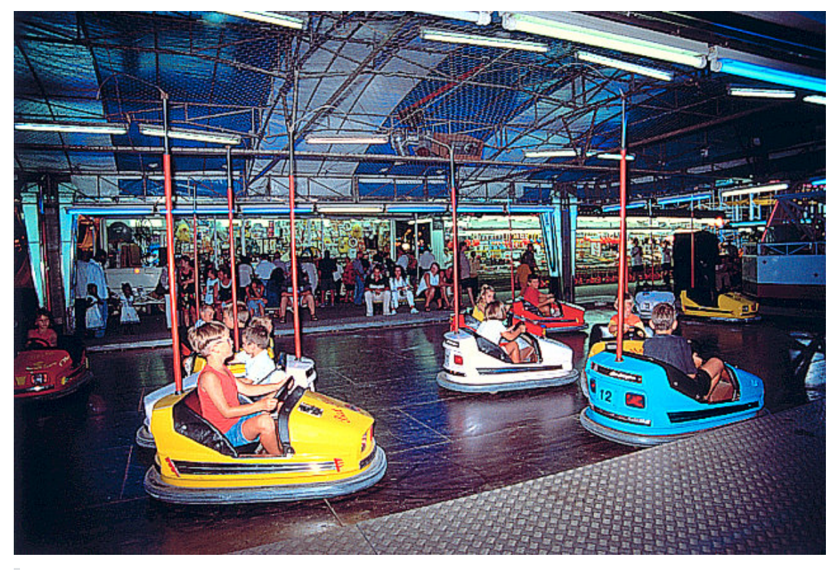
They call this steam machine.

The steam machine works similar to the red upon a bumper cars installation but wireless. It's the cause of all the violence in this hell network and it permit human semi physical transposition. I use the substantive Vatican because in subliminal voice to skull there's a lot of person from the ancient state of Vatican.