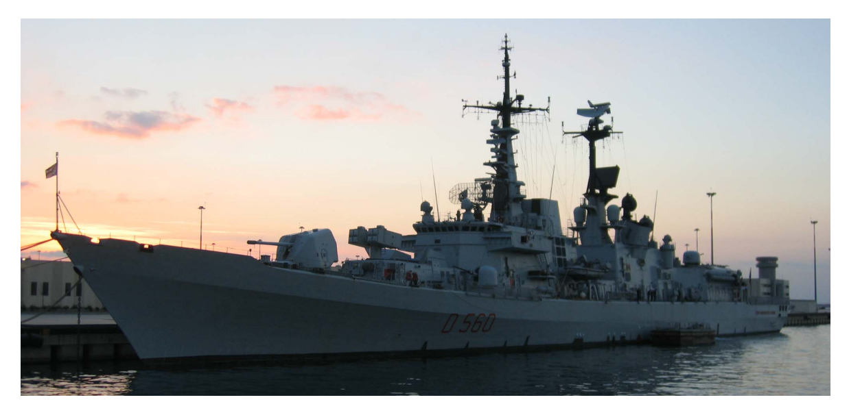
This destroyer [26] has got her surname. It's from the Italian Navy [27]. Search it in Wikipedia! Spread the world.